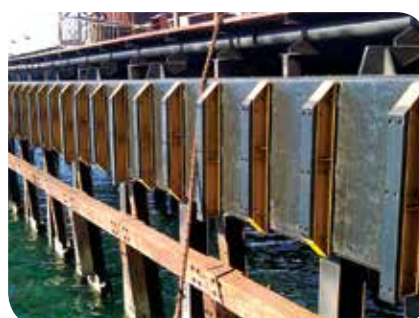
POLYSTYRENE UHMWPE FENDER