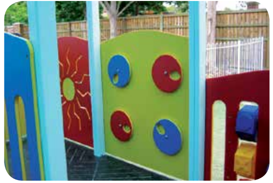
TIMBER REPLACEMENT PLAYGROUND EQUIPMENT