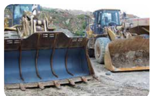
MATROX LINERS TO REDUCE HANG UP