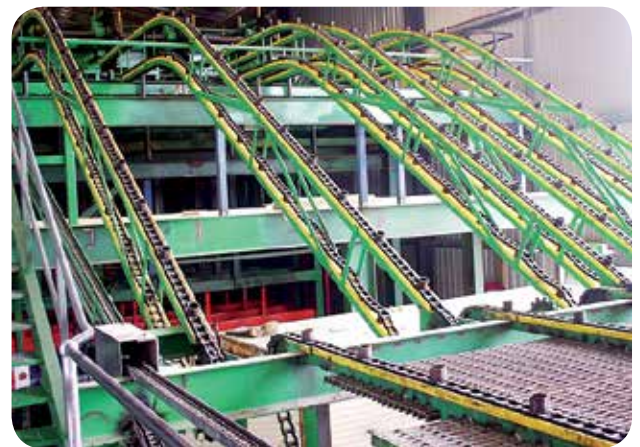
TIMBER CHAIN GUIDES