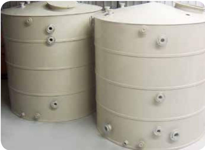
PP & HDPE SHEET FOR CHEMICAL STORAGE TANKS