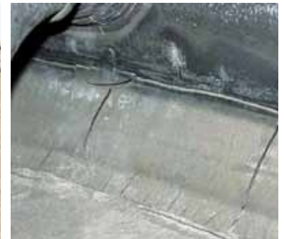
Stress cracking reduces tank & vessel integrity resulting in structural failure.