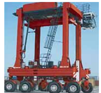
Figure 2. Typical straddle crane