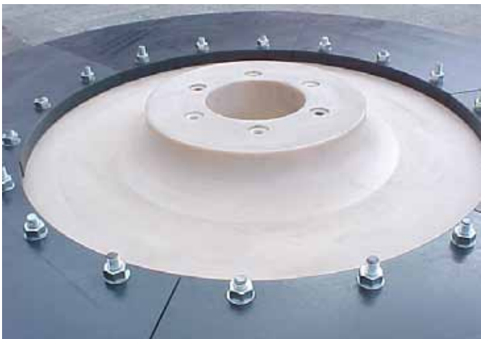
Figure 4. Split sheave with removable central hub

The use of Sustamid 6G M nylon sheaves results in reduced dead weight, increased working capacity, and lower inertial loads in operation. Furthermore, reduced weight of Sustamid 6G M nylon sheaves makes it easier to handle during installation and replacement than their steel counterparts.