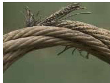
Figure 1. Strand break on six (6) lay wire rope.

Wire rope running over a Sustamid 6G M nylon sheave can have its serviceable life extended by as much as 600%, through less crown and tangential breaks. Equipment operation is improved since Sustamid 6G M nylon is lighter and has self-lubricating properties. These qualities allow for greater loads on booms and lower maintenance costs.