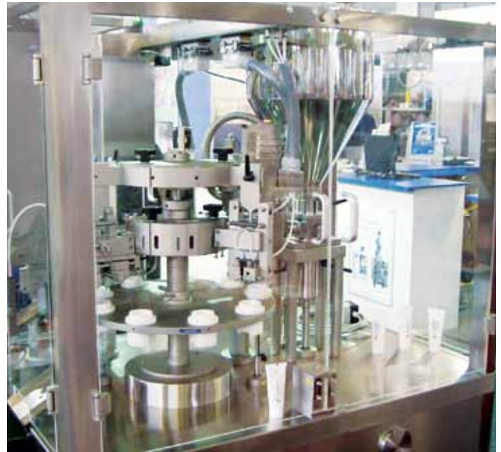
Optically Clear Safety Guards