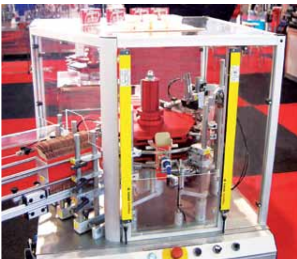
Noise Control Enclosures

Manufactured with a unique hard coat surface which is applied to both sides, Safeguard Hard provides excellent scratch, chemical and graffiti resistant properties.