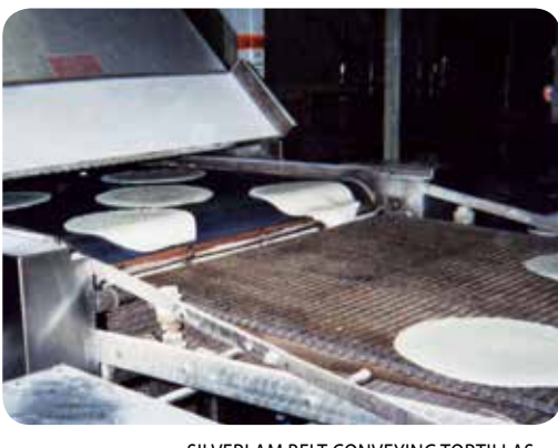
SILVERLAM BELT CONVEYING TORTILLAS

Chemlam Laminates are pinhole and crack free providing better resistance against grease wicking, lower overall permeation and greater wear resistance compared to standard dip-coat products. Uniform PTFE thickness over the texture of the fibreglass fabric reinforcement eliminates thin spots in coating that can cause premature failure. Applications include; Bakeware/cooking liners, conveyor belts on contact grilling machines, polymer processing and traditional applications for PTFE coated fabrics for improved product durability and performance.