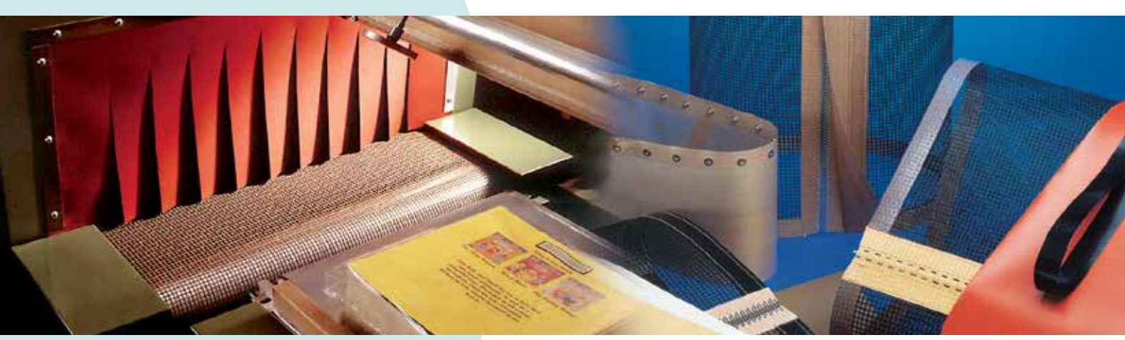
& PROCESS CONVEYOR BELTS