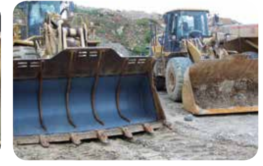
MATROX LINERS TO REDUCE HANG UP