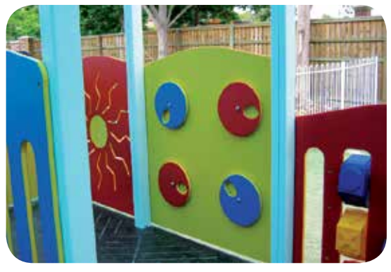
TIMBER REPLACEMENT PLAYGROUND EQUIPMENT