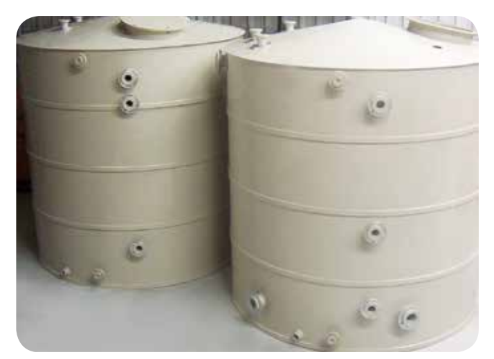
PP & HDPE SHEET FOR CHEMICAL STORAGE TANKS