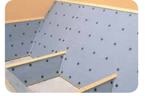
MATROX LINING INSTALLED TO MANUFACTURERS RECOMMENDATION POLYSTONE UHMWPE FENDER